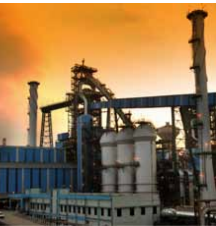
DANIELI CORUS BLAST FURNACE