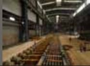
HOT STRIP MILL