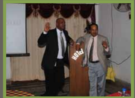
A BRAINSTORMING SESSION IN PROGRESS