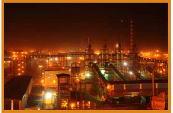
ARIAL VIEW OF BLAST FURNACE