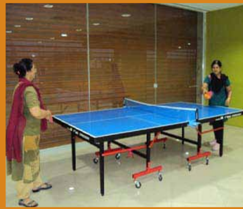
LADIES ENJOYING TABLE TENNIS GAME