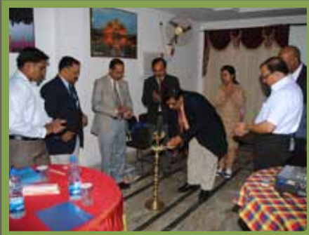
LAMP LIGHTENING BY THE COO