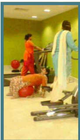
WOMEN ENJOYING HEALTH CLUB