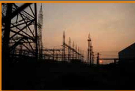
MAIN RECEIVING SUB STATION

Accept the challenges, so that you may feel the exhilaration of victory.