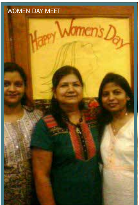
WOMEN DAY MEET