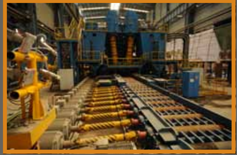
HOT STRIP MILL