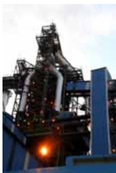
BELL LESS TOP OF BLAST FURNACE

With the commissioning of these facilities, BSL is all set to make the difference in the Steel Industry by strong commitment to provide value to its customer and focusing on premium market segments like automobile sector, IF, HSLA, API, LPG and boiler grades. The company has tied up with Sumitomo Metal Industries of Japan, for developing these grades by utilizing their technical expertise within the shortest possible time.