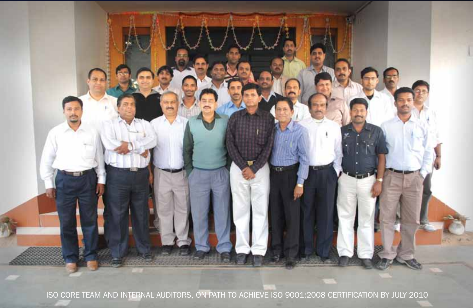
ISO CORE TEAM AND INTERNAL AUDITORS, ON PATH TO ACHIEVE ISO 9001:2008 CERTIFICATION BY JULY 2010

Date : 30.03.09 VICE CHAIRMAN & MANAGING DIRECTOR