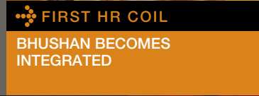
FIRST HR COIL BHUSHAN BECOMES INTEGRATED