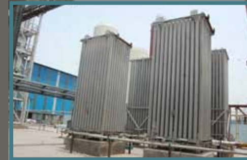
405 TPD OXYGEN PLANT