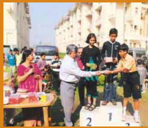
PRIZE DISTRIBUTION CEREMONY